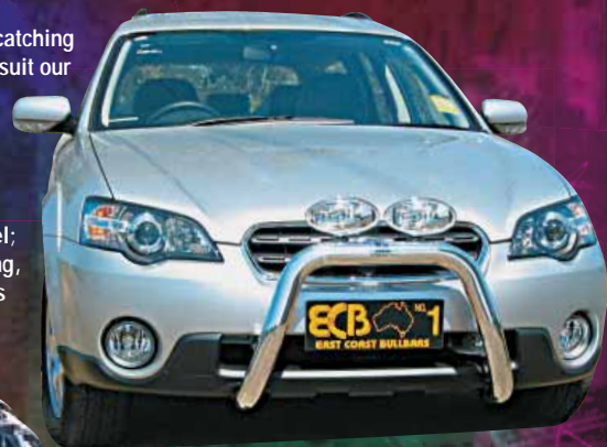
OUTBACK (9/03 ON) - 63MM NUDGE BAR

Impact protection is just one of the benefits of this eye-catching Nudge Bar. Designed and manufactured in Australia to suit our harsh Australian conditions, this 63mm Nudge Bar is formed from high tensile alloy tubing and will never corrode or rust. It also has equal or better strength than poor quality, thinner sectioned, imported stainless steel products and is up to 50% lighter in weight. Each ECB Nudge Bar is designed to suit each individual model; therefore you can be assured of an aesthetically pleasing, functional and reliable design. These 76mm Nudge Bars come complete with spotlight mounting provisions, together with a choice of polished or powder coated alloy finishes.