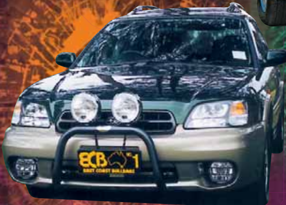
OUTBACK (10/98-8/03) 47MM NUDGE BAR Silver Hammertone Powder Coated Alloy

Contact ECB's National Information Centre for your local ECB outlet