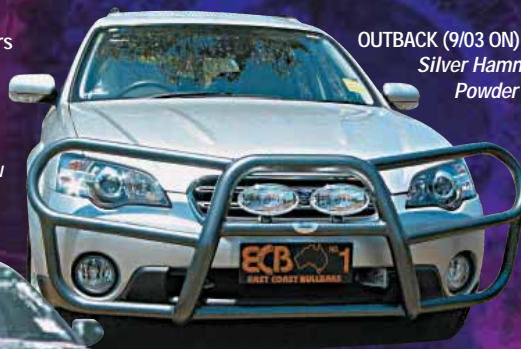
OUTBACK (9/03 ON) TYPE 8 Silver Hammertone Powder Coated Alloy